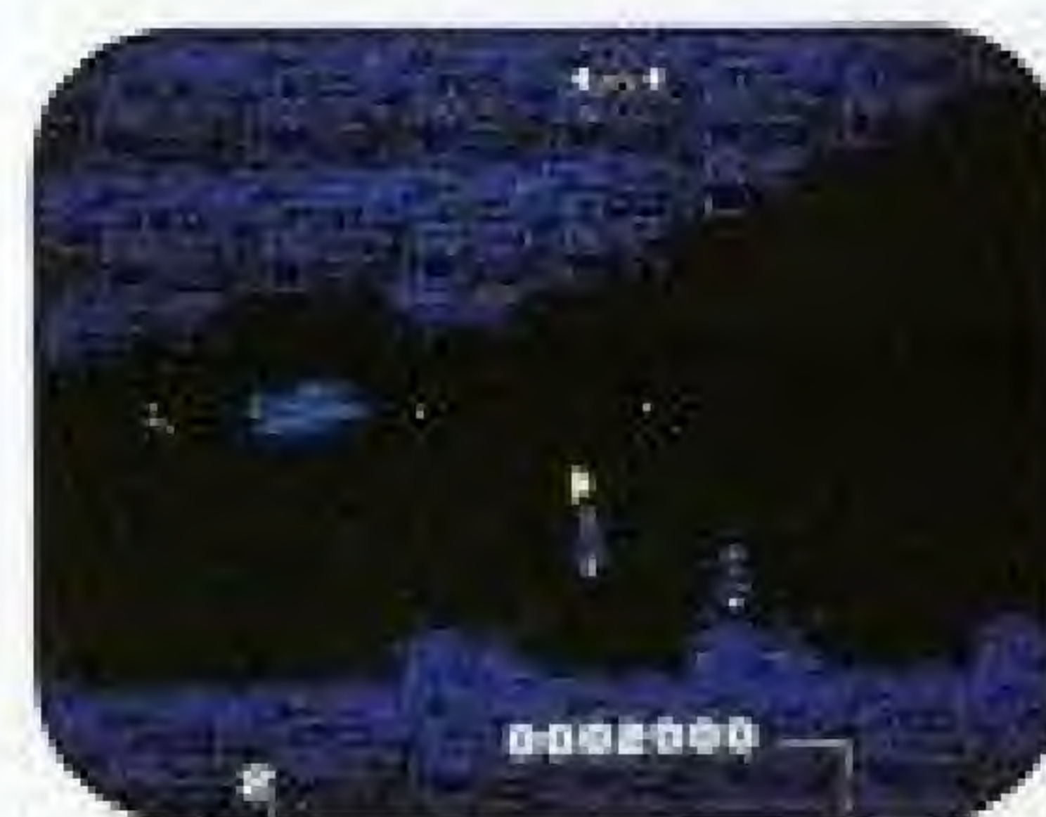
# OF LIVES REMAINING

You enter the Base Station with three lives. You can lose a life by running out of energy or by accumulating three damage points. The game is over when all three lives are lost.